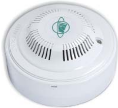
Shown with base